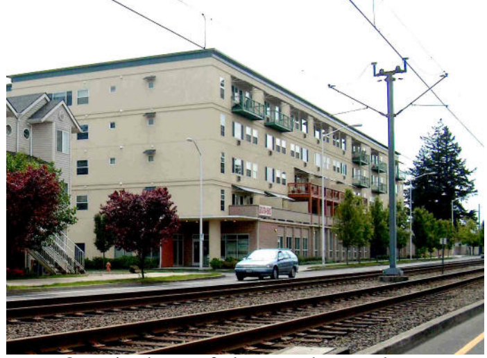
Oversized, out of place condo complexes