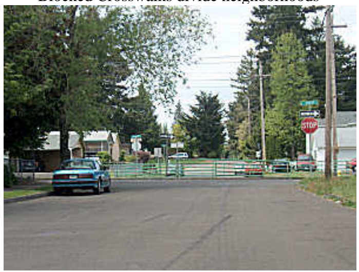
Blocked Streets divide neighborhoods