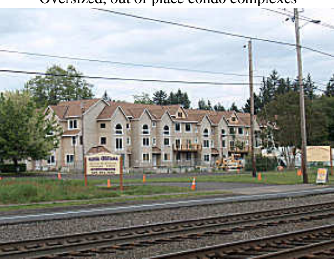
High Density Housing Causes Congestion