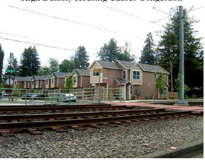
Most new residents still drive so congestion increases

See: www.PortlandFacts.com/Transit/RailMenu.html