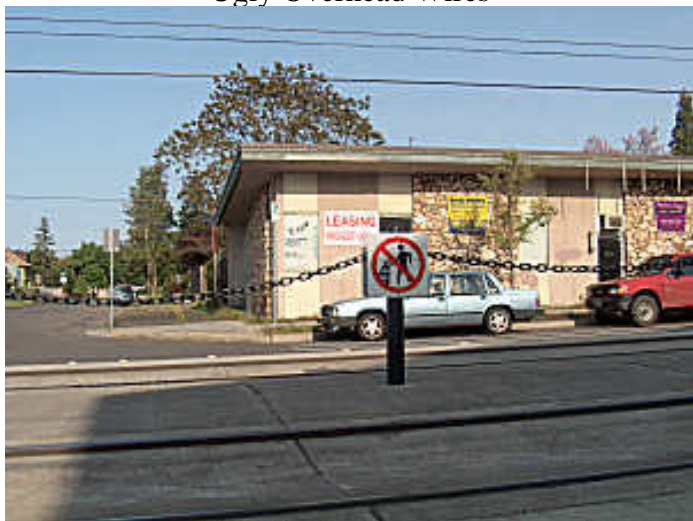
Blocked Crosswalks divide neighborhoods